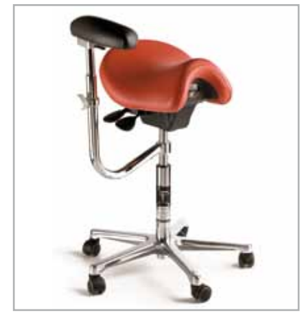
Fig. 4: The seat is available in different colors and versions. Therefore it fits into every treatment room.

Mary Gale, an Australian occupational therapist and inventor of the Bambach® Saddle Seat, researched the sitting position on horses, the fact that people with a wheelchair are able to sit on horseback without any support and why equestrians suffering from back problems are pain free once on horseback. You can learn more about her experiences from her book and leaflet about this seat. Please request free literature and appointment for demonstration at Hager & Werken's (www.hagerwerken. de). Legions of dental professionals and the general public cannot move without pain due to poor posture. Choosing the Bambach Saddle Seat will solve this problem. Make the smart choice. On a Bambach® Saddle Seat.