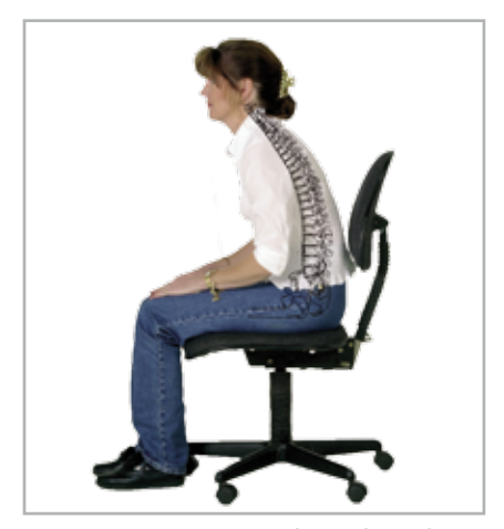
Fig.\,2: Incorrect\ posture\ with\ a\ traditional\ Seat.